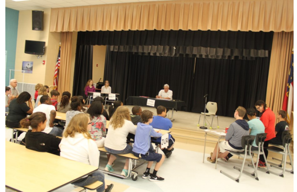
CIS Peer Court in session.

Partnerships with Brunswick County Schools, the Brunswick County District Attorney’s Office, compassionate volunteers and community partners, help these programs serve over 4,000 students and families each year.