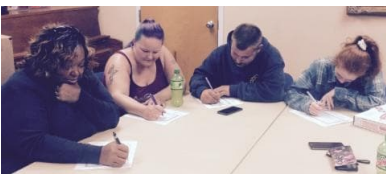
Incredible Years parenting class.

CIS Incredible Years Parenting Program (IY) is taking place in Southport, Shallotte, and Bolivia. The Southport program is at Trinity United Methodist Church, 209 E. Nash St.; Shallotte’s classes are held at Shallotte Presbyterian Church, 5070 Main Street; and the Bolivia class is held at Hope Harbor Home. The first few class sessions focus on positive things parents can do to receive positive behaviors from children, then later sessions move on to techniques to decrease children’s negative behaviors.